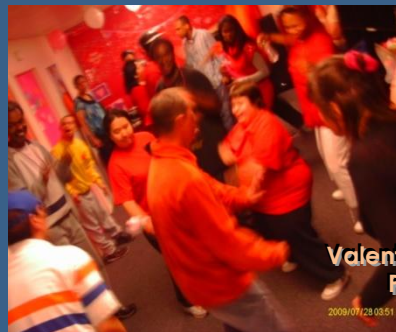
Valentine's Day Party