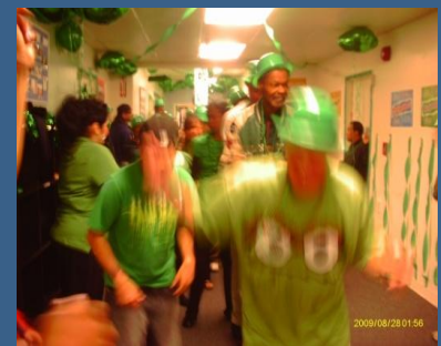
St. Patrick's Day Dance