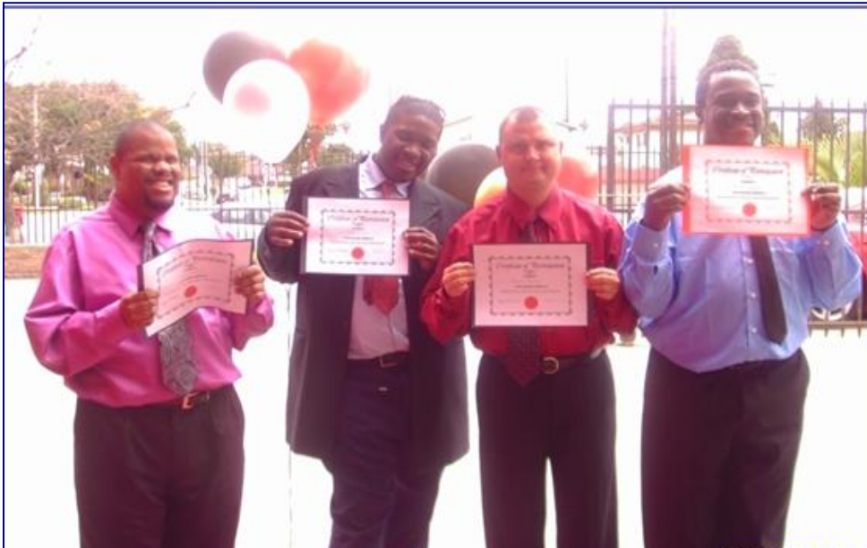
Clients proudly display their certificates at Pieces of Me Showcase

"Pieces of Me Spring Profile Showcase" was presented at RIL on Thursday, April 21 st and was a great success. As friends, family, and supporters gathered to watch their loved ones walk the runway, the clients beamed with pride, confidence, and joy. The music began and the clients went into action smiling from ear to ear. Many clients carried props such as cameras, hats, and brief cases symbolizing, in part, who they are, their aspirations or hobbies.