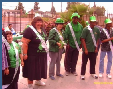
St. Patrick's Day "Royal Clover Court"