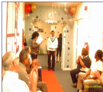
Pieces of Me Runway

As the event closed the clients were awarded certificates for participation and were recognized and honored for sharing pieces of who they are. The event was RIL's first Spring Profile Show Case, a truly memorable occasion and one to be repeated.